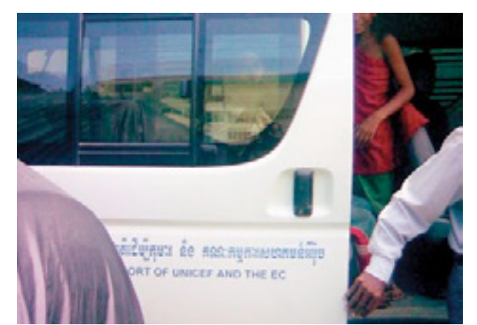
Figure 4: Photo reported as showing children being transported to an abusive 'rehabilitation' centre in a UNICEF/EU vehicle, a claim denied by Unicef<sup>103</sup>

of the day is filled with agricultural labor, physical exercise, watching television, and free time.<sup>99</sup>