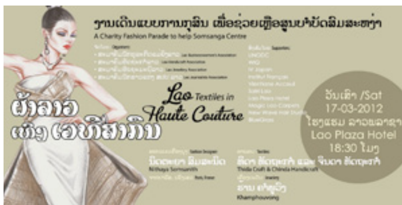
Figure 3: Invitation to a fundraiser for the Somsanga drug detention centre, cosponsored by UNODC, March 2012

DETENTION CENTRES IN CHINA AND VIET NAM ARE IN ESSENCE SLAVE LABOUR CAMPS, WITH DETAINEES FORCED TO MEET DAILY WORK QUOTAS FOR PRIVATE COMPANIES THAT CONTRACT WITH CENTRE MANAGEMENT.